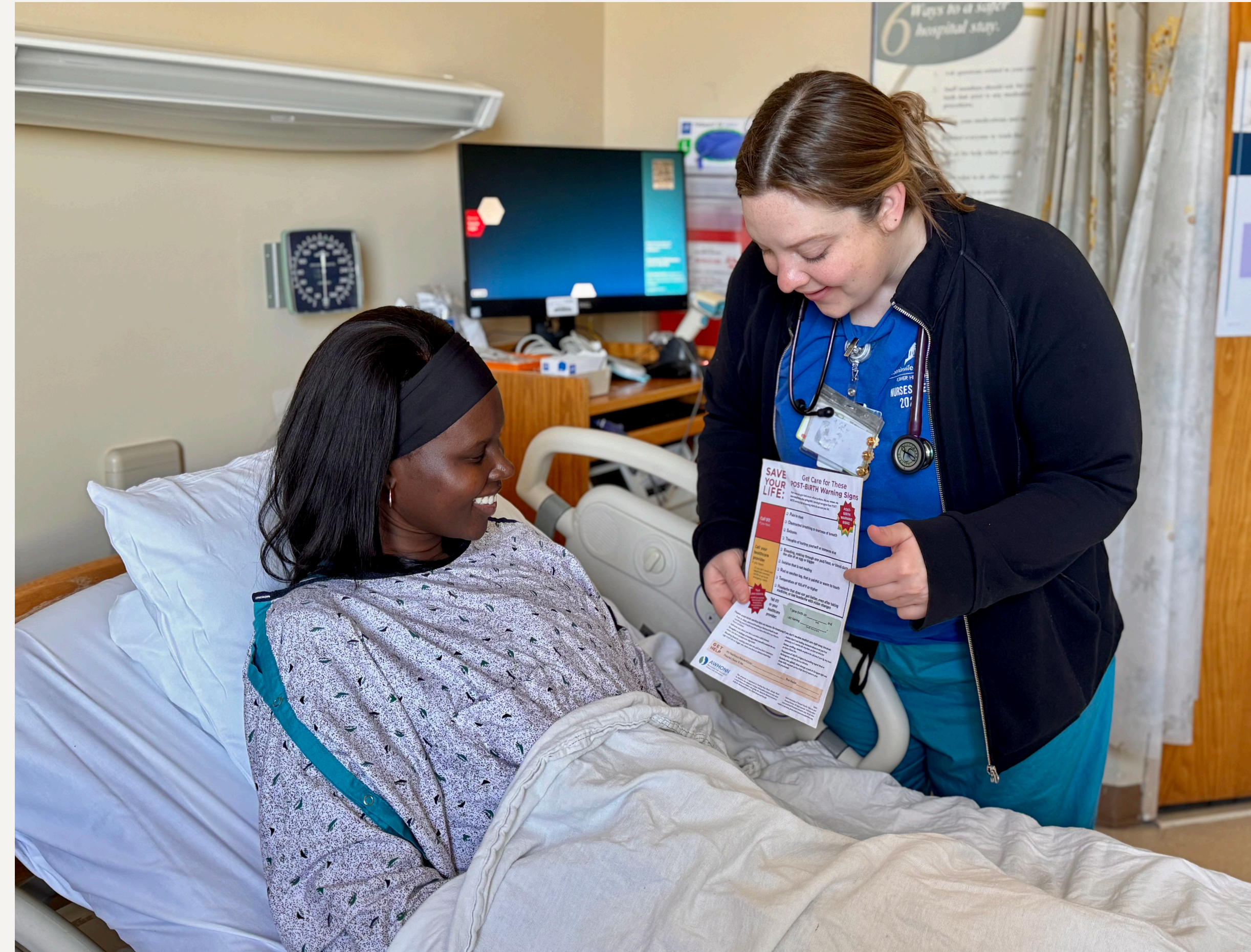
Educating patients on maternal warning signs.

Posted Maternal Warning signs posters in patient rooms, and in the ER waiting area. Emailed Maternal Warning signs posters to the clinics and offices associated with Phoenixville Hospital.